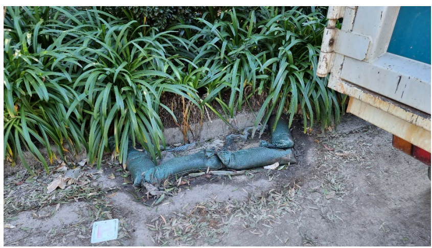
Plate 1. Sediment trap around the stormwater inlet in carpark