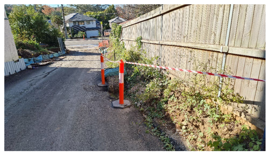
Plate 2. Sediment fencing and check dams on driveway edge

Plate 1. Sediment trap around the stormwater inlet in carpark