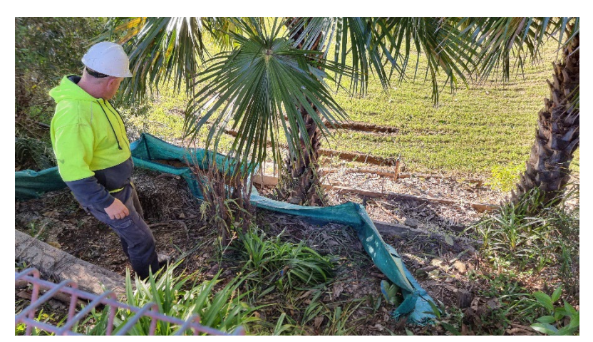
Plate 3. Established surface water point from active work area across vegetated areas