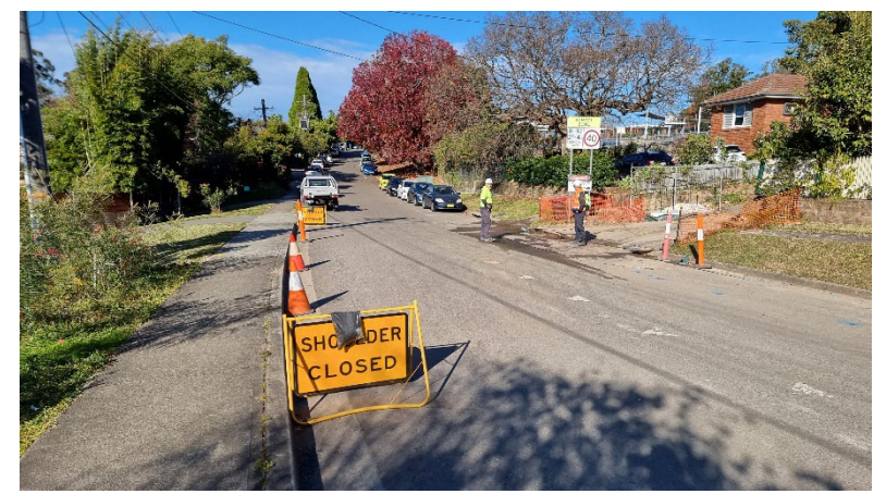
Plate 4. View from Mount Pleasant Avenue towards the site entrance