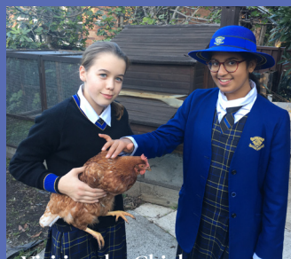
Visiting the Chickens