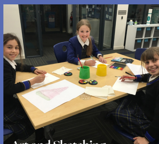
Art and Sketching